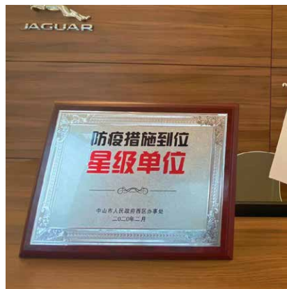
Won the "Outstanding Unit of Epidemic Prevention" Award issued by the West District office of Zhongshan City