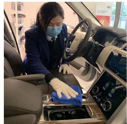
Disinfecting cars at showroom

The Group is extremely concerned about the potential health and safety impact of COVID-19 on its employees and customers. Hence, at the beginning of the epidemic, the Group closely monitored the epidemic situation and formulated a series of measures and guidelines, such as the Various Guidelines for Protections (各類防護指南), Epidemic Prevention and Control Work Plan for New Centenary (創世紀疫情防控工作方), and Optimization Plan for Security Cleaning (保安保潔優化方案), which clearly guide and stipulate the epidemic prevention procedures that employees are required to follow. Moreover, the Group appoints the epidemic prevention officers in each dealership outlet as stipulated in the Epidemic Prevention Officer of Each Dealership Outlets (各店防疫負責人) to further strengthen employees' awareness and management of epidemic prevention. Meanwhile, the Group provided sufficient anti-epidemic and disinfection materials for each dealership store, required employees and customers to take body temperature checks before entering the dealership store, and set up waste mask collection buckets and other facilities to ensure the prevention of the spread of COVID-19 and avoid outbreak. Under strict epidemic prevention measures, no individual in the dealership outlets of the Group has been infected up to date.