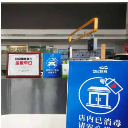
All environments adhere to daily disinfection