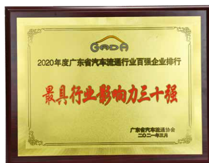
Guangdong Automobile Dealers Association - “Most Industry Influential Top 30” among 2020 Guangdong top 100 enterprise in the automobile distribution industry.