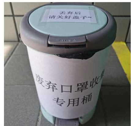
Waste mask collection trash can