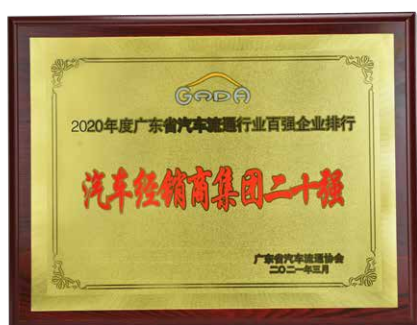
Guangdong Automobile Dealers Association - “Automobile Dealership Top 20” among 2020 Guangdong top 100 enterprise in the automobile distribution industry.