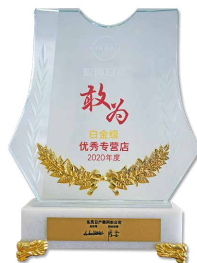
Zhongshan Dongri Automobile Company Limited was awarded with “Platinum-level Excellent Franchise Store” by Dongfeng Nissan Passenger Vehicle Company