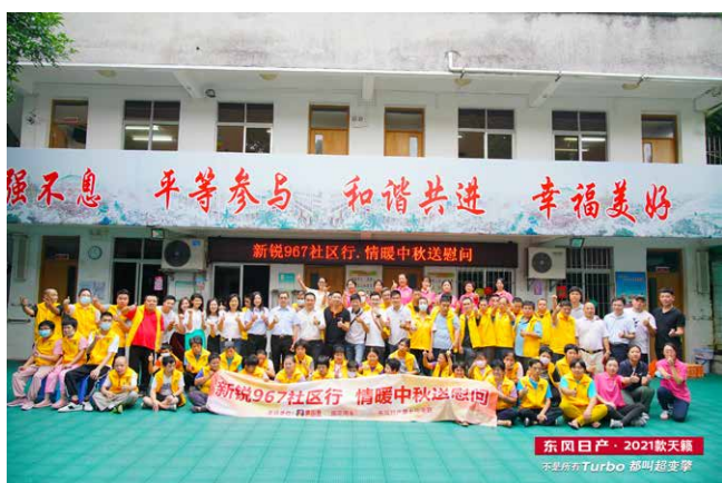
Charity activities for special school during Mid-autumn festival