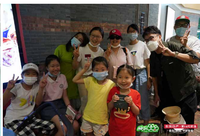
Volunteering activities during Mother's Day at radio station